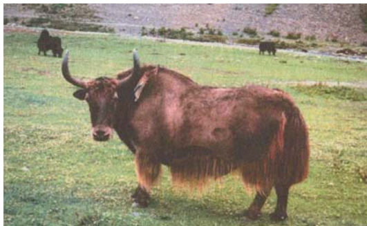
Fig. 1. A maize germplasm thrives to adapt even at 3500m. under farmer's conservation effort.

This will demand linkage between climate and agriculture models to provide in advance the agriculture production estimation to farmers to policy level.