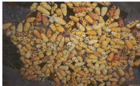
Fig. 2. If the global warming occurs, the Himalayan economic asset like yak will face adaptation problem forcing to move upward beyond the reach of human settlement.