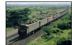
infrastructure for food distribution

GECAFS-Southern Africa research will identify the social and geographical distributions of vulnerability of the region's food systems to GEC in the context of other stresses.