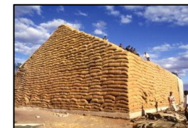
food storage policies and facilities