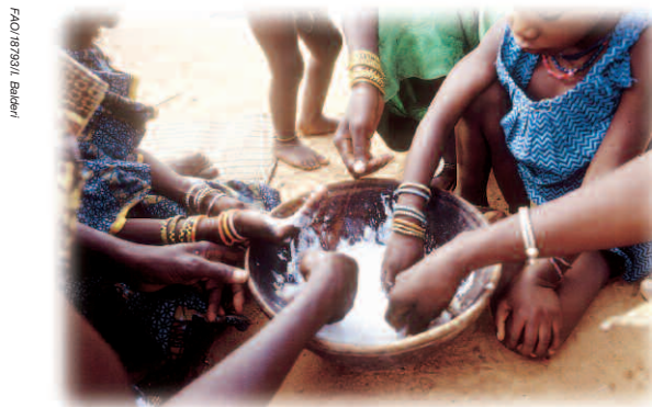
Food utilisation: nutritional value, social value and food safety.

There is growing concern that global environmental change will further complicate food security – particularly for more vulnerable sections of society. There are also concerns that meeting society's rising demand for food will further degrade the environment which may, in turn, further undermine food systems and therefore food security. Food security policies need to be developed in the context of these environmental issues.