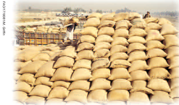
Food availability: production, distribution and exchange.

There is growing concern that global environmental change will further complicate food security – particularly for more vulnerable sections of society. There are also concerns that meeting society's rising demand for food will further degrade the environment which may, in turn, further undermine food systems and therefore food security. Food security policies need to be developed in the context of these environmental issues.