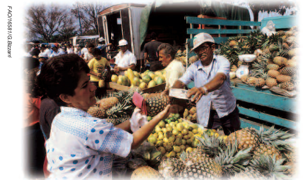
Food access: affordability, allocation and preference.

Food systems encompass (i) activities related to the production, processing, distribution, preparation and consumption of food; and (ii) the outcomes of these activities which contribute to food security (food availability, food access and food utilisation).