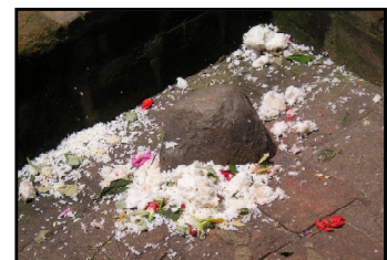
religious and social function

GECAFS-IGP research is identifying the social and geographical distributions of vulnerability of the region's food systems to GEC in the context of other stresses.