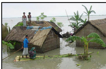
climate change and weather extremes