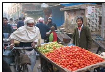
food marketing and trade